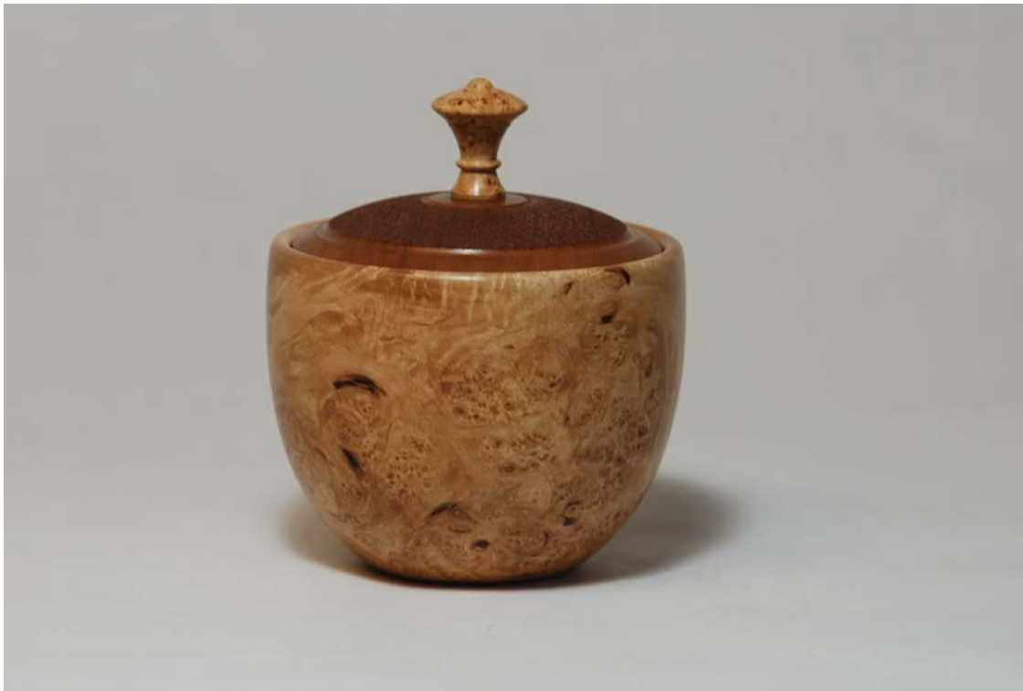
Phil Reed small covered pot maple burl