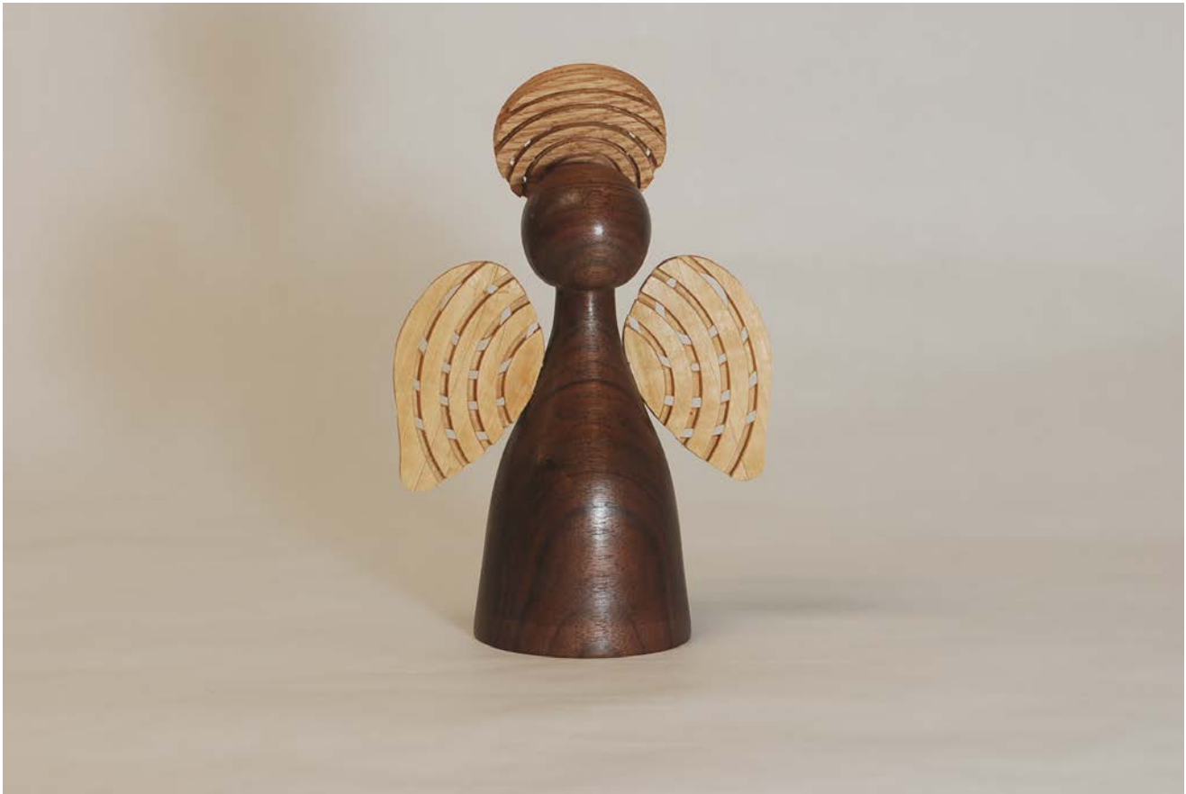
Angel by Leo Beller out of walnut and maple, Trees below by Tom Deneen of rhododendron, dogwood and quince