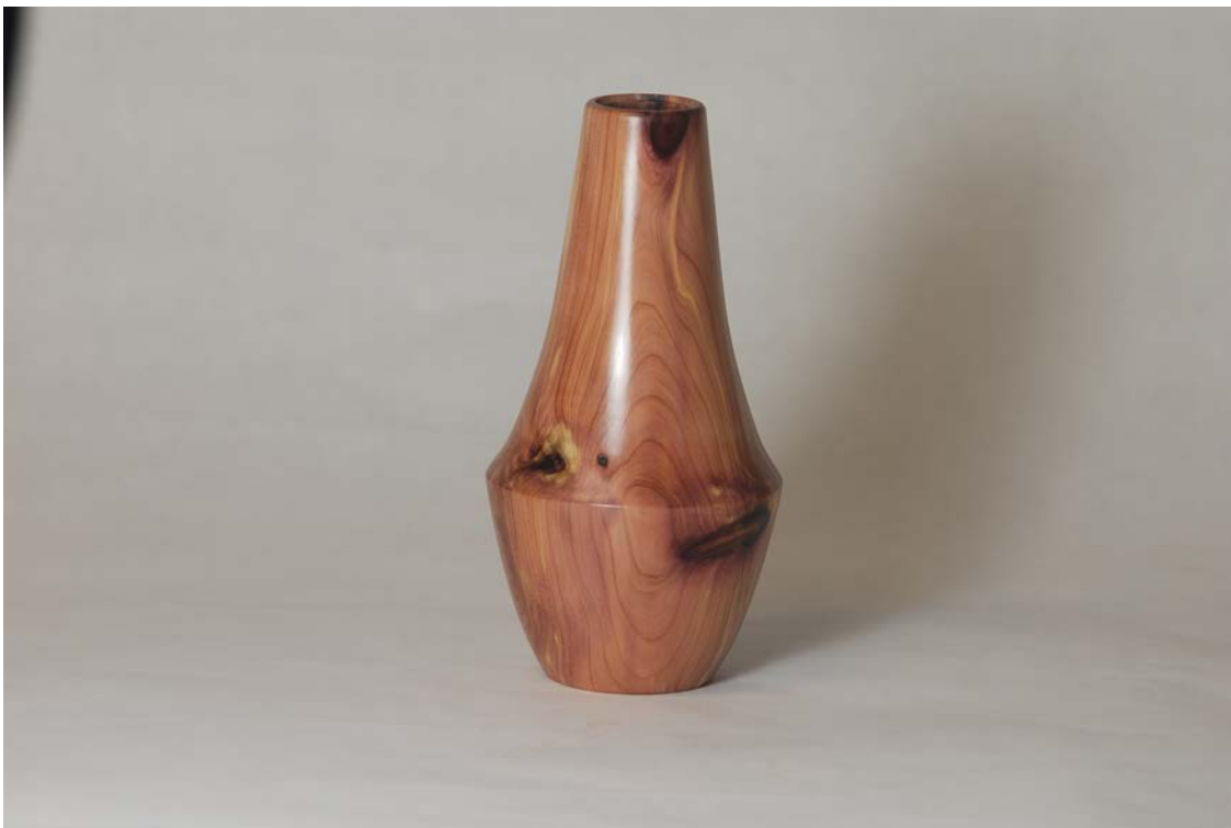
Barry Stump vase cedar (test tubes from ebay for flowers)