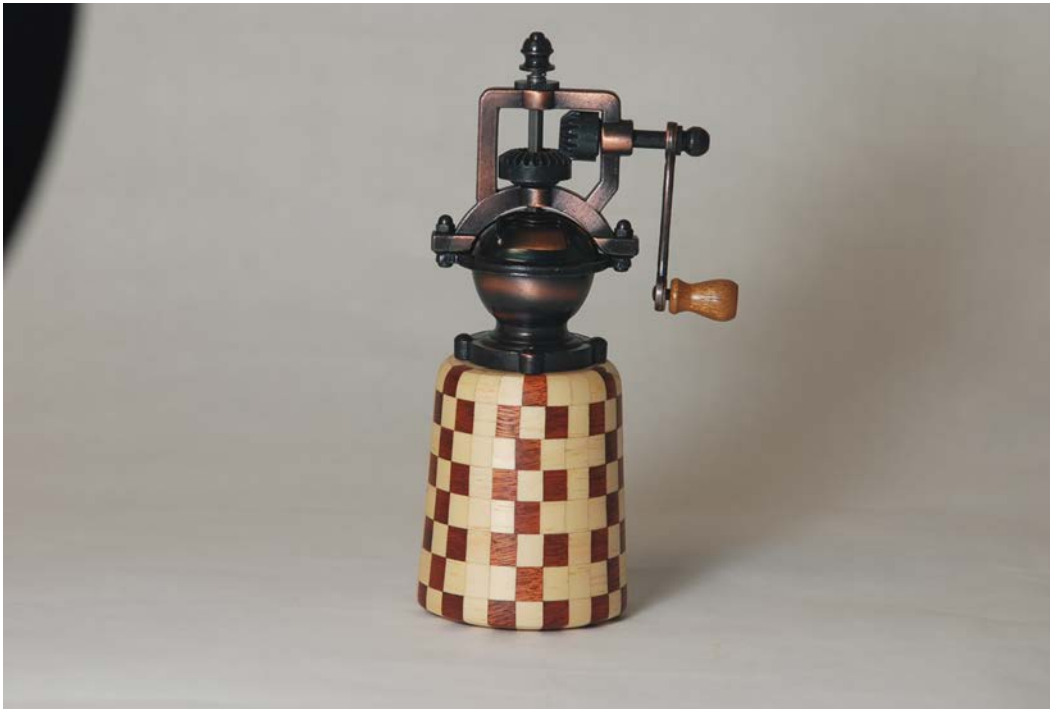
Leo Deller segmented pepper mill