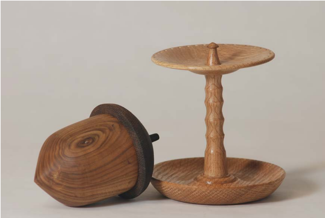
Jewelry holder oak

Tom Deneen acorn box butternut and walnut