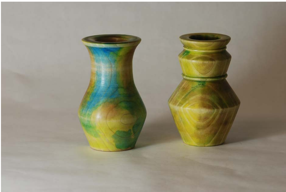
Barb Fordney 2 weed pots dyed poplar