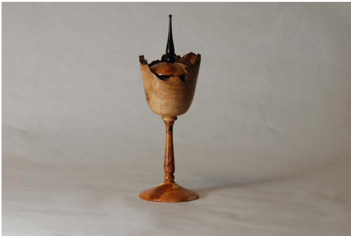
Barry Stump natural edge lidded goblet cherry burl, ewe, maple dyed black for finial